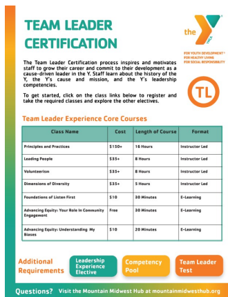
Team Leader Certification